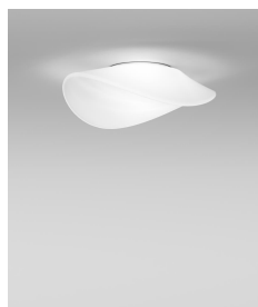
BALAN PP M