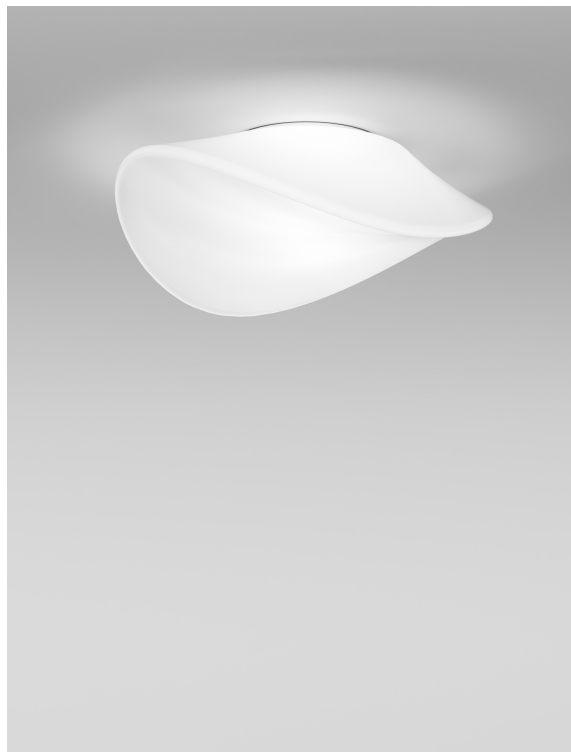
BALAN PP G BCLU BC E27 CE